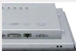
Rugged steel structure