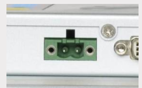
Phoenix terminal using fastening type power connector