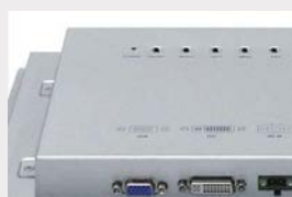
Control buttons on the rear panel