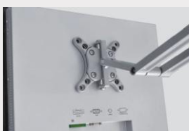
Supports VESA wall mount