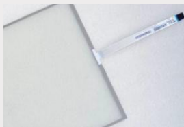
Using precision resistive touch screen